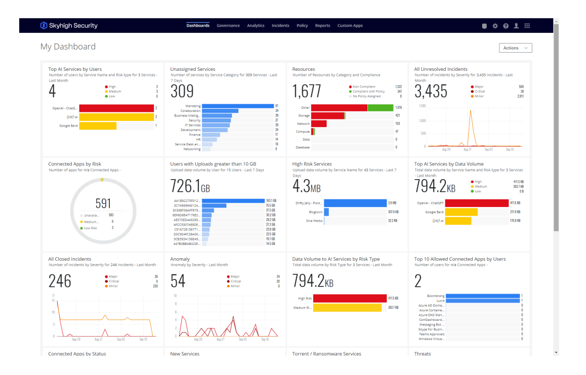
Figure 3. A single pane of glass management interface to manage web-based and cloud-based risks and threats.

• For an extra layer of security for web traffic, Skyhigh SWG also integrates seamlessly with Skyhigh Cloud Firewall, which extends protection to all IP-based ports and protocols (UDP, TCP/IP, RDP). When Skyhigh Cloud Firewall detects HTTP and HTTPS traffic on non-standard ports, it routes that traffic to Skyhigh SWG. Only the traffic that needs deep content inspection is sent to Skyhigh SWG, while the rest takes a faster path for better throughput. Skyhigh Cloud Firewall even uses the same client as Skyhigh SWG, making it easy to deploy and manage.