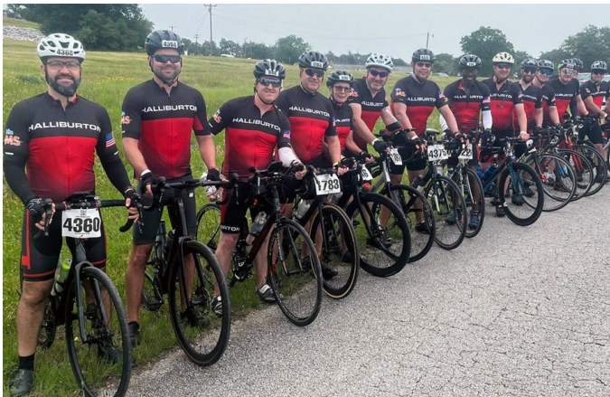
Halliburton team joins forces to complete the MS150, a 150-mile bike ride to support multiple sclerosis research

A team of Halliburton cyclists participated in the MS150, a 150-mile bike ride from Houston to College Station, and raised over $57,000 for multiple sclerosis research. Our employees' participation in this event underscores Halliburton's commitment to medical research and our support for causes that promote health and wellness.