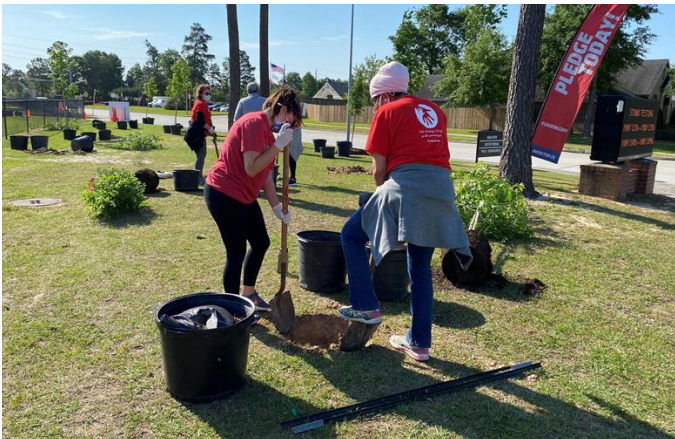
Halliburton employees plant trees with Trees for Houston

As part of our commitment to environmental responsibility, Halliburton worked with the Permian Strategic Partnership, a coalition that addresses challenges such as road safety, water conservation, and housing in the Permian Basin. This partnership promotes the responsible, sustainable development and use of the region's natural resources.