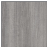
Platinum Gray (PG)