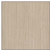
Natural Elm (NE)