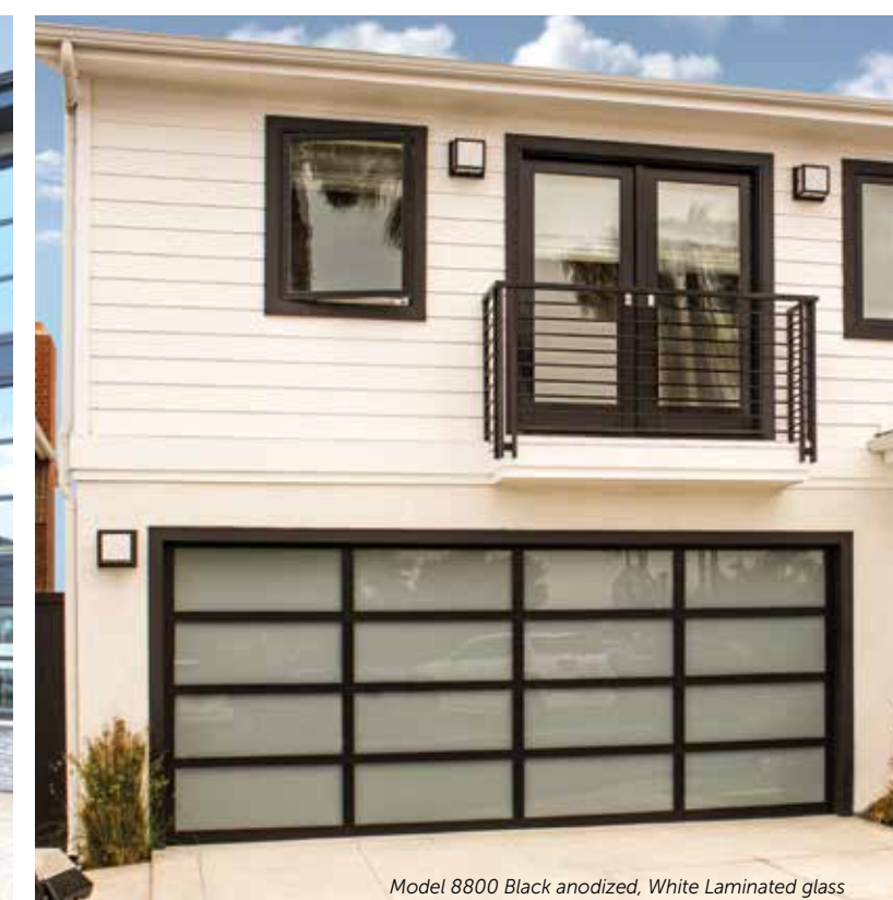
Model 8800 Black anodized, White Laminated glass