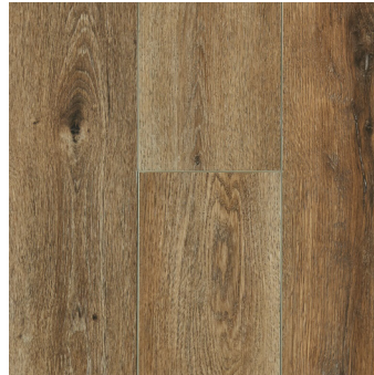
WAGON WHEEL T-VS-LVT-WGNWL-LVT-8X60-5MM20MIL