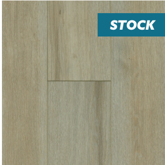
HONEY BEE T-VS-LVT-HNYB-LVT-8X60-5MM20MIL