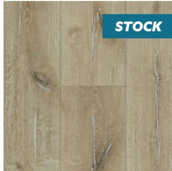
GOOD MORNING T-VS-LVT-GDMRN-LVT-8X60-5MM20MIL