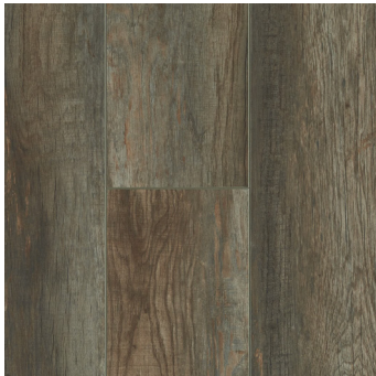
DUSKY SKY T-VS-LVT-DSKSK-LVT-9X60-6MM22MIL