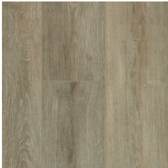
FOGGY MORN T-VS-LVT-FGMRN-LVT-9X60-6MM22MIL