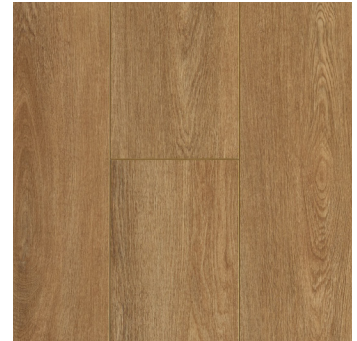
TRAIL DAZE T-VS-LVT-TRLDZ-LVT-9X60-6MM22MIL