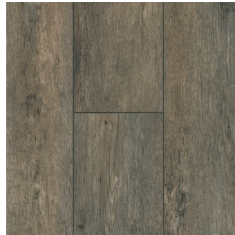
BOAT DOCK T-VS-LVT-BTDK-LVT-9X60-6MM22MIL