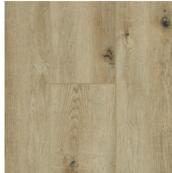
COZY CABIN T-VS-LVT-CZCBN-LVT-9X60-6MM22MIL