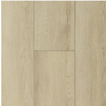
WHITE SAND T-VS-LVT-WSA-LVT-9X60-6MM22MIL