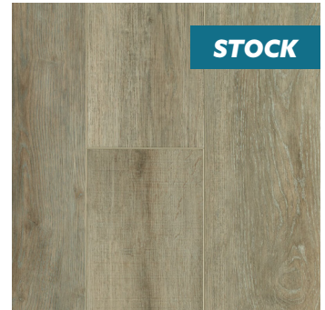
RIVER SHOAL T-VS-LVT-RVRSL-LVT-9X60-6MM22MIL