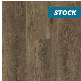
FOREST HIKE T-VS-LVT-FRSTHK-LVT-9X60-6MM22MIL