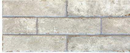
Buckhead 3" x 11" x 5/16" IFS3X11ABB