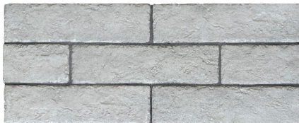
Midtown 3" x 11" x 5/16" IFS3X11ABM