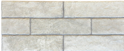
Westside 3" x 11" x 5/16" IFS3X11ABW