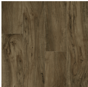
Walnut Fudge Low Gloss 2.0 mm: 3P107641 2.5 mm: 3P20764