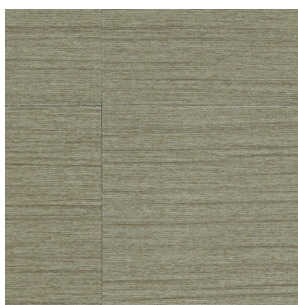
Stone Thistle Medium Gloss 2.0 mm: 3P111821 2.5 mm: 3P211821