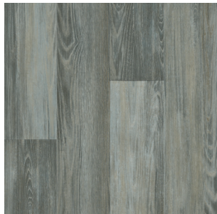
Oak Pewter Low Gloss 2 mm: 3P108641 2.5 mm: 3P208641