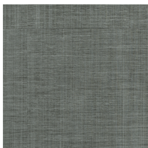
Linen Storm Medium Gloss 2.0 mm: 3P109821 2.5 mm: 3P209821-