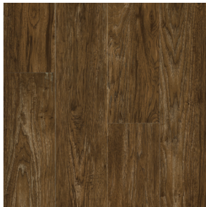
Hickory Caramel Medium Gloss 2.0 mm: 3P103641 2.5 mm: 3P203641