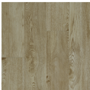
Oak Sunset Low Gloss 2.0 mm: 3P104641 2.5 mm: 3P204641