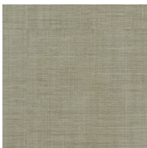
Linen Flax Medium Gloss 2.0 mm: 3P110821 2.5 mm: 3P210821