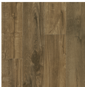
Oak Sunrise Low Gloss 2.0 mm: 3P106641 2.5 mm: 3P206641