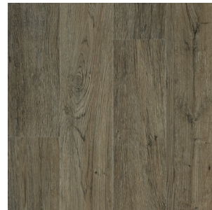
Rustic Oak Dunescape Medium Gloss 2.0 mm: 3P102641 2.5 mm: 3P202641