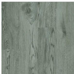
Oak Silver Low Gloss 2.0 mm: 3P105641 2.5 mm: 3P205641