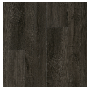
Rustic Oak Nightfall Medium Gloss 2.0 mm: 3P101641 2.5 mm: 3P201641