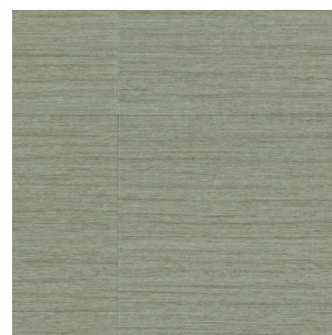
Stone Biscotti Medium Gloss 2.0 mm: 3P112821 2.5 mm: 3P212821