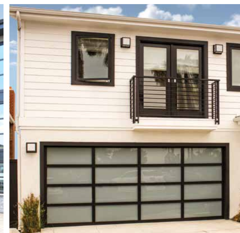
Model 8800 Black anodized, White Laminated glass