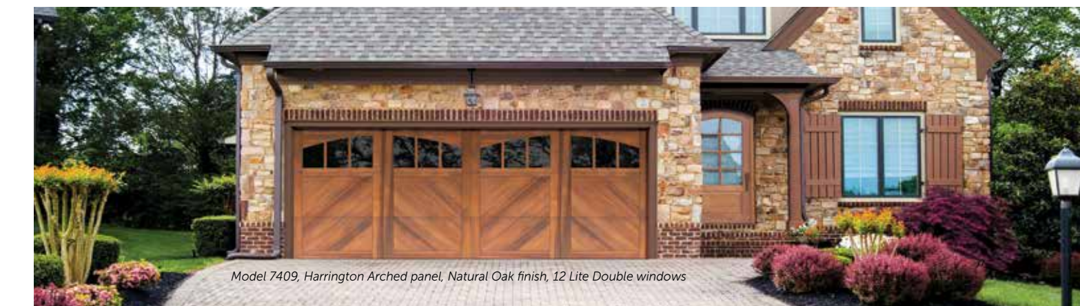
Model 7409, Harrington Arched panel, Natural Oak finish, 12 Lite Double windows

*Wayne Dalton uses a calculated door section R-value for our insulated doors. **Some heights and widths will be special order. Contact Customer Service for details. ***See wind load document on each product for details and ratings. *Section thickness may vary slightly depending on wood type.