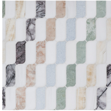
Multi Veined Bianco Dolomiti, Azul Cielo, Vanilla Onyx, Lilac, Rosa Portogallo, Ming Classico