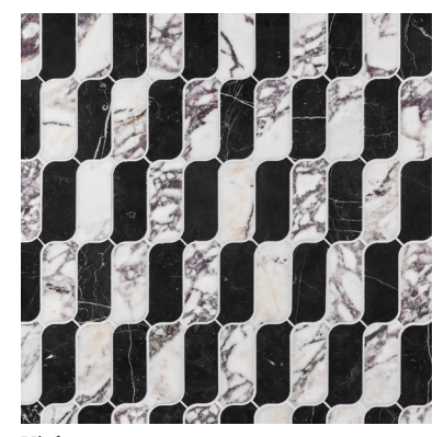
Viola Calacatta Viola, Nero Marquina