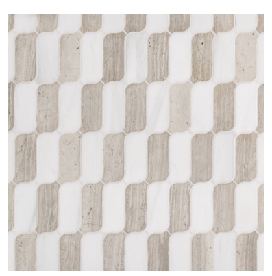
Cloud Bianco Dolomiti, Cloud Limestone