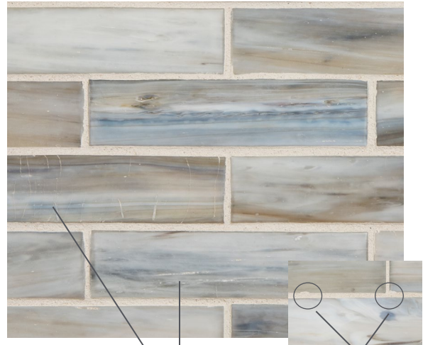
SURFACE FOLDS, SHALLOW CRACKS & CHIPS

The surface will collect grout during the grouting process. The amount of grout visible after installation will depend primarily on the contrast between the grout color and tile color, how well the tiles were cleaned before/after grouting, and viewing distance. Make sure your installer reads our installation instructions thoroughly to achieve the best look.