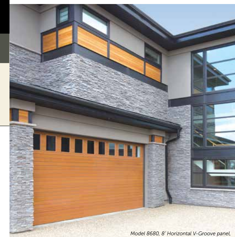
Model 8680, 8' Horizontal V-Groove panel, Natural Oak finish, Vertical windows