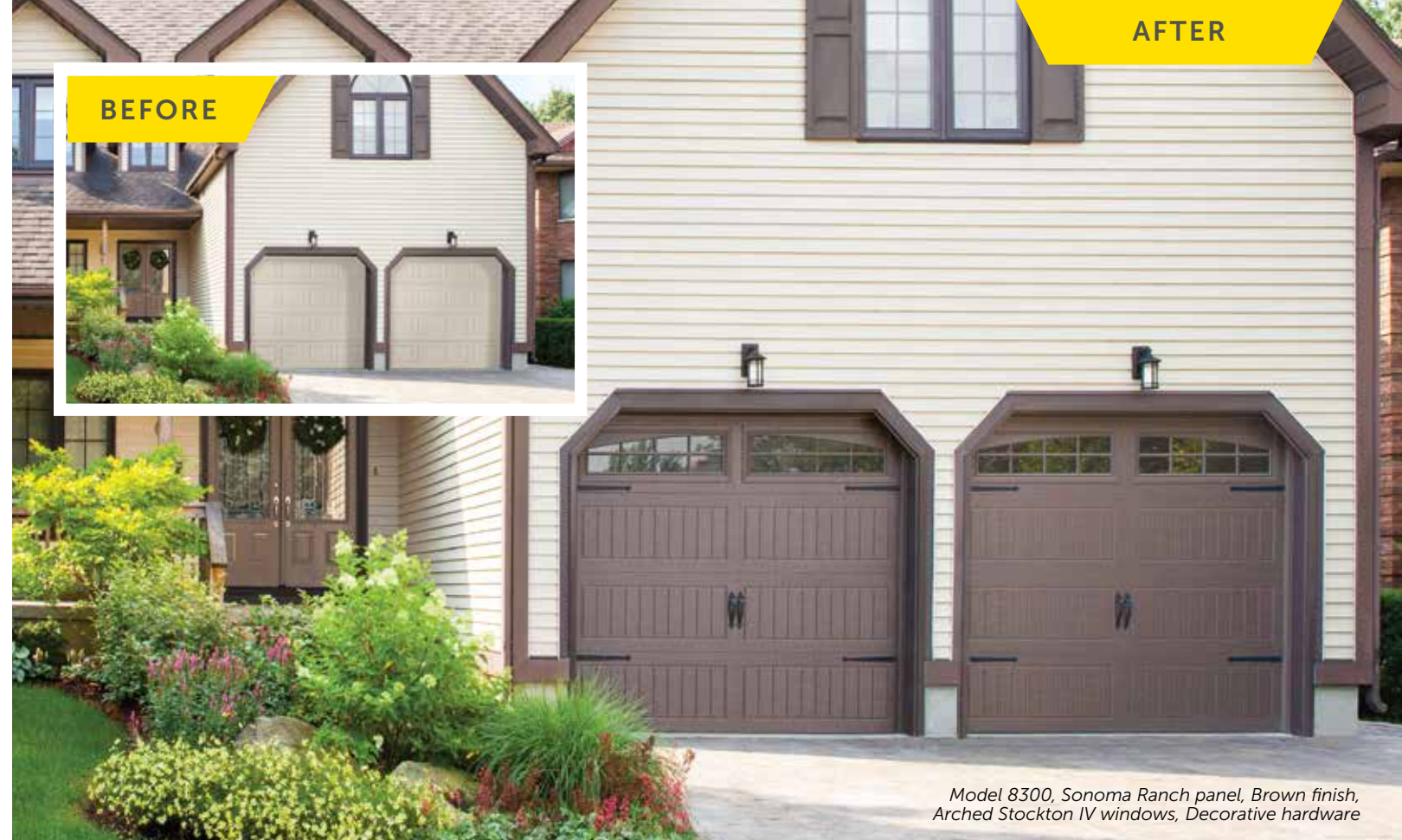
Model 8300, Sonoma Ranch panel, Brown finish, Arched Stockton IV windows, Decorative hardware