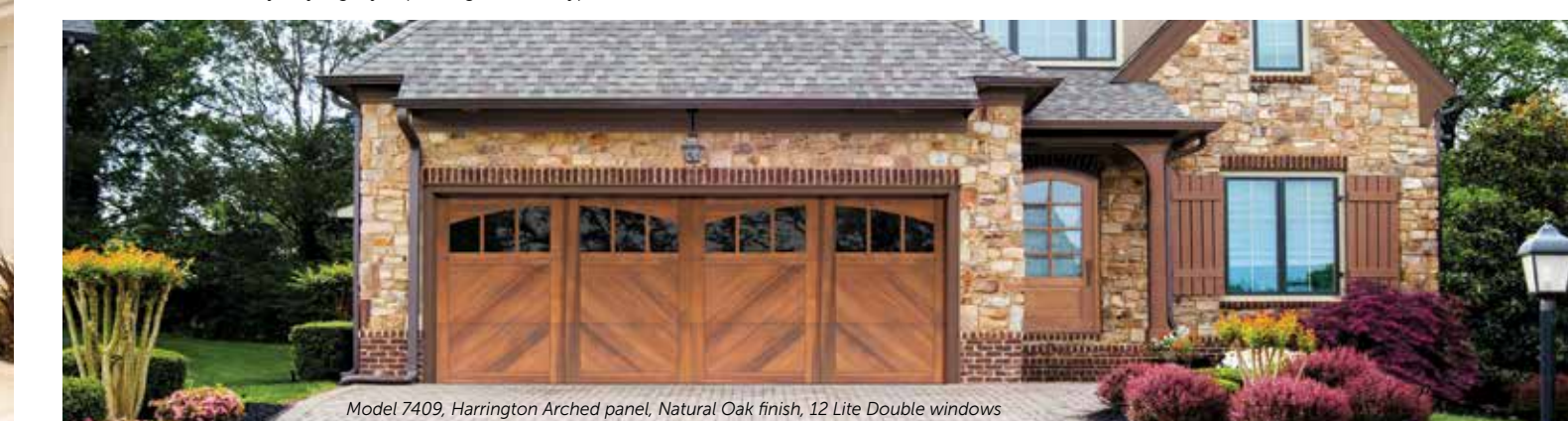
Model 7409, Harrington Arched panel, Natural Oak finish, 12 Lite Double windows

• Section thickness may vary slightly depending on wood type.