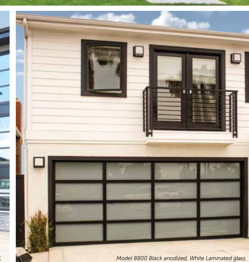
Model 8800 Black anodized, White Laminated glass