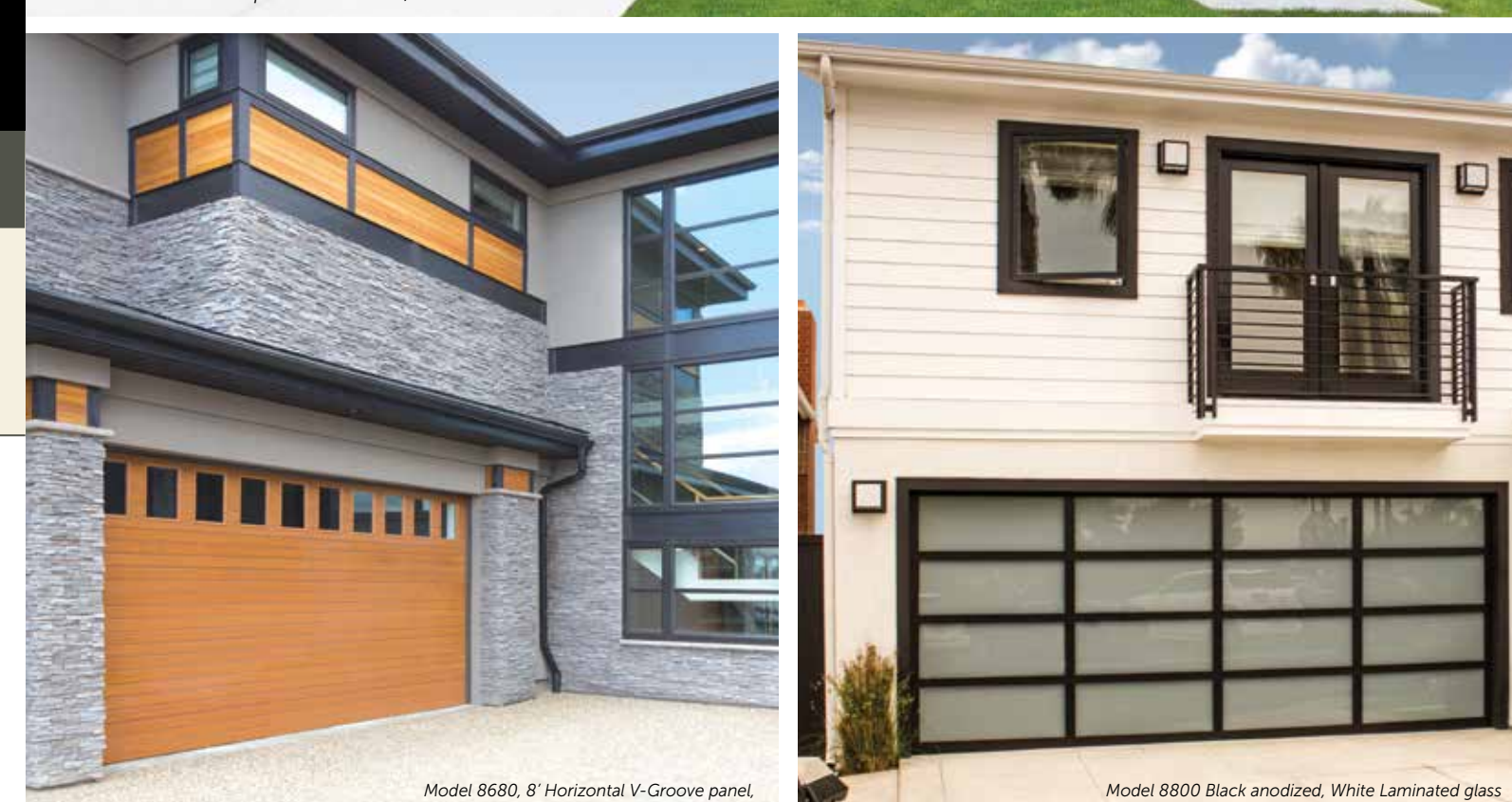
Model 8680, 8' Horizontal V-Groove panel, Natural Oak finish, Vertical windows