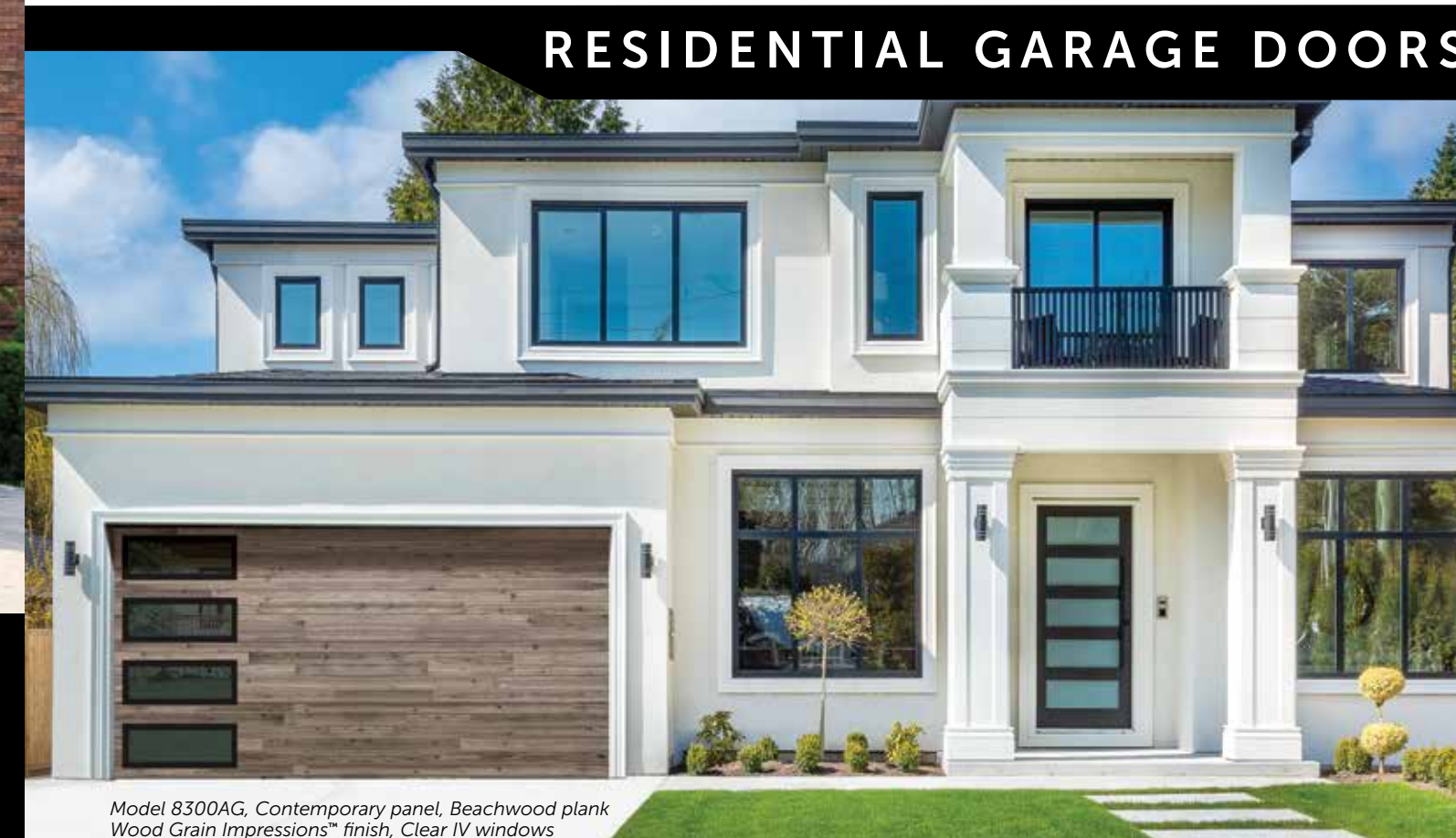
Model 8300AG, Contemporary panel, Beachwood plank Wood Grain Impressions™ finish, Clear IV windows