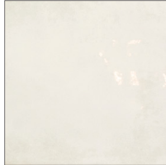
SEA SALT | Glossy T-VS-SHRLN-SEAS-WT-8X24-GLS

Material Composition: White Body Application: Wall Wet or Dry Minimum Grout Joint: 3/16" Recycled Content: 21% Water Absorbtion: >10% Abrasion Resistance/PEI: 1 Scratch Hardness/MOHS: 5 Country of Origin: Spain