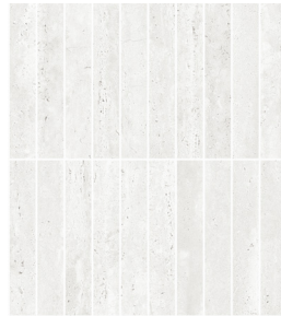
Homestead Silver Mosaic

11½" x 9 ¾" ( 1"x6" small pcs pressed ) AC ( SATIN ) - DCOF WET ≥0.42 CERAMIC FLOOR/WALL TILE