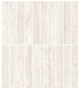
Homestead Bone Mosaic

11½" x 9 ¾" ( 1"x6" small pcs pressed ) AC ( SATIN ) - DCOF WET ≥0.42 CERAMIC FLOOR/WALL TILE