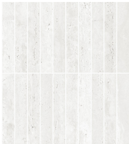
Homestead White Mosaic

11½" x 9 ¾" ( 1"x6" small pcs pressed ) AC ( SATIN ) - DCOF WET ≥0.42 CERAMIC FLOOR/WALL TILE