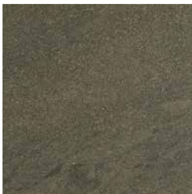
AV294 ▶ Mafic