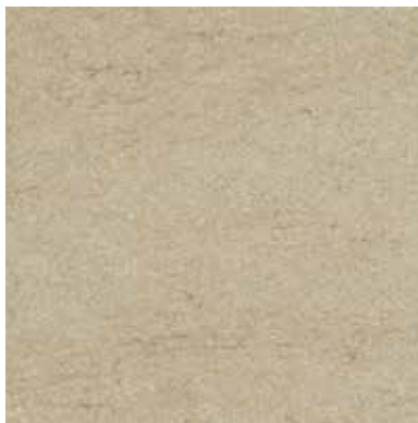
AV292 ▶ Caldera