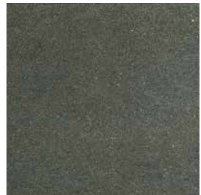
AV295 ▶ Magma