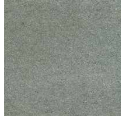
AV293 ▶ Bedrock