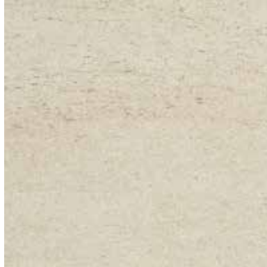
AV291 ▶ Silica