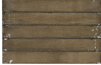
Loden Green 2" x 16" x 5/16" IFS2X16HLG