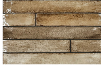
Tierra Brown 2" x 16" x 5/16" IFS2X16HTB