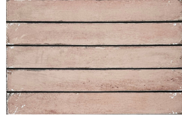
Cerda Rosa 2" x 16" x 5/16" IFS2X16HCR