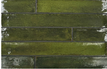
Bosque Verde 2" x 16" x 5/16" IFS2X16HBV