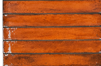
Mission Red 2" x 16" x 5/16" IFS2X16HMR