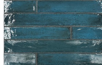
Deep Blue 2" x 16" x 5/16" IFS2X16HDB