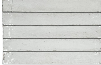
White 2" x 16" x 5/16" IFS2X16HW