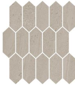
Muirfield Beige Picket Mosaic

12-1/4" x 11-1/8" sheet ( cuts 2"x5") AC (SATIN) - DCOFWET 0.42 CERAMIC FLOOR/WALL TILE