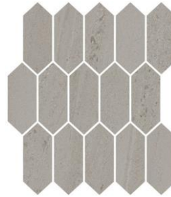
Muirfield Gray Picket Mosaic

12-1/4" x 11-1/8" sheet ( cuts 2"x5") AC (SATIN) - DCOFWET 0.42 CERAMIC FLOOR/WALL TILE