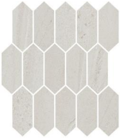
Muirfield Off-White Picket Mosaic

12-1/4" x 11-1/8" sheet ( cuts 2"x5") AC (SATIN) - DCOFWET 0.42 CERAMIC FLOOR/WALL TILE