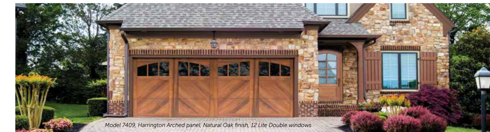
Model 7409, Harrington Arched panel, Natural Oak finish, 12 Lite Double windows

*Wayne Dalton uses a calculated door section R-value for our insulated doors. **Some heights and widths will be special order. Contact Customer Service for details. ***See wind load document on each product for details and ratings. *Section thickness may vary slightly depending on wood type.