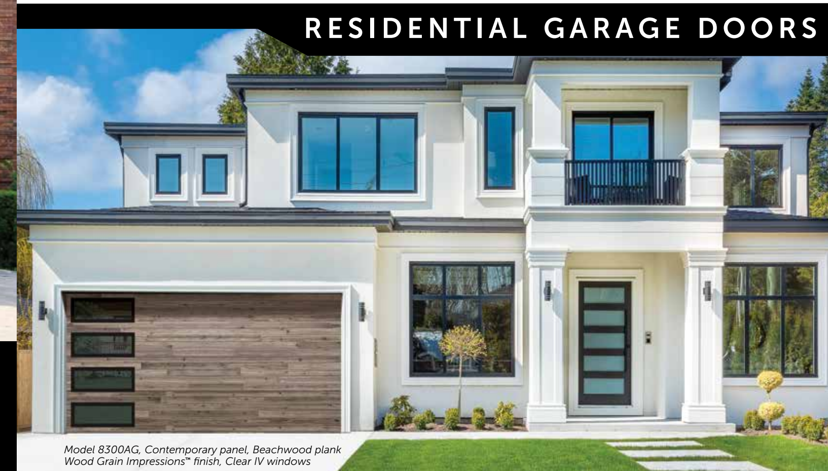
Model 8300AG, Contemporary panel, Beachwood plank Wood Grain Impressions™ finish, Clear IV windows