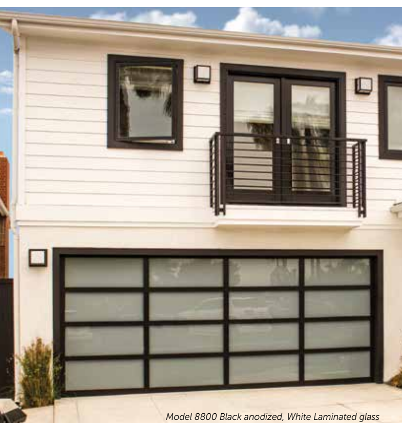
Model 8800 Black anodized, White Laminated glass