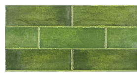
Hunter Green 2" x 6" x 5/16" IFS2X6HHG