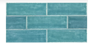
Turquoise 2" x 6" x 5/16" IFS2X6HTQ