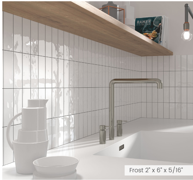
Frost 2" x 6" x 5/16"

View all of our product options and detailed specifications at: mlwsurfaces.com