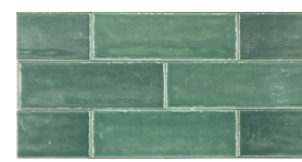
Forest Green 2" x 6" x 5/16" IFS2X6HFG