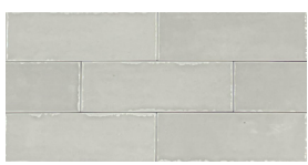
Silver 2" x 6" x 5/16" IFS2X6HS