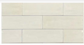
Beige 2" x 6" x 5/16" IFS2X6HB