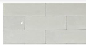
Frost 2" x 6" x 5/16" IFS2X6HHF