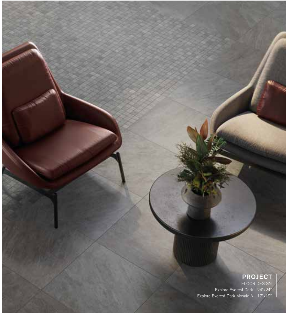
PROJECT FLOOR DESIGN Explore Everest Dark - 24"x24" Explore Everest Dark Mosaic A - 12"x12"