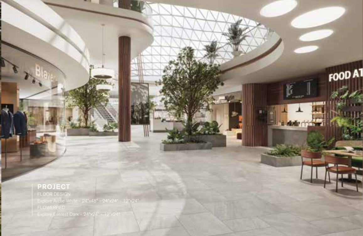
PROJECT FLOOR DESIGN Explore Arctic White - 24"x48" - 24"x24" - 12"x24" Explore Everest Dark - 24"x24" - 12"x24" WALL DESIGN Explore Everest Dark - 24"x24" - 12"x24"