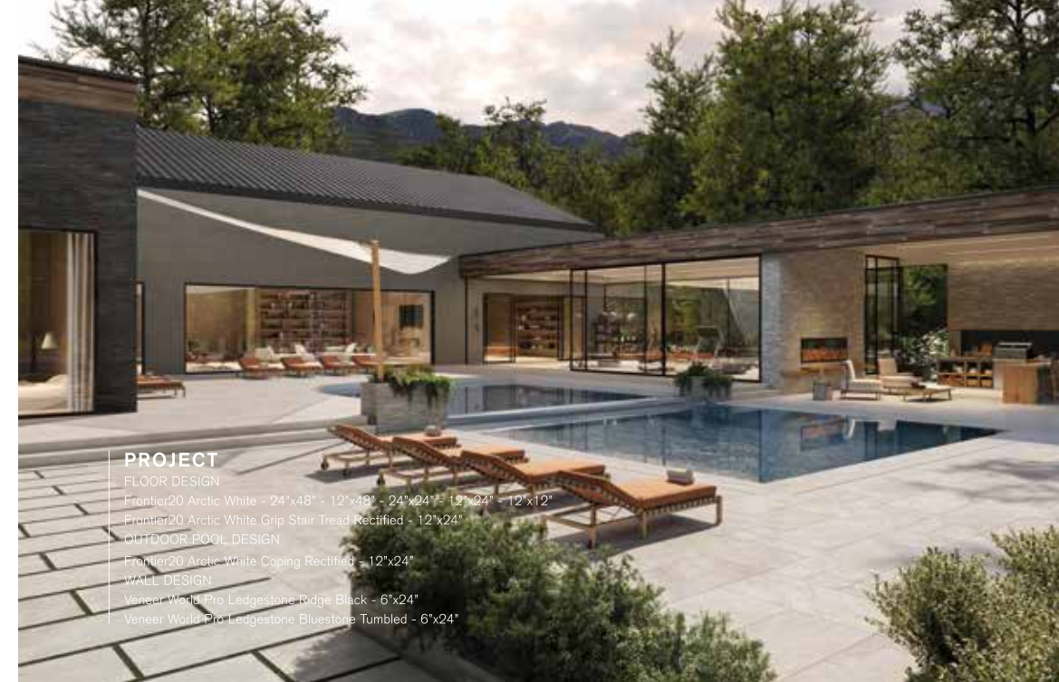
PROJECT FLOOR DESIGN Frontier20 Arctic White - 24"x48" - 12"x48" - 24"x24" - 12"x24" - 12"x12" Frontier20 Arctic White Grip Stair Tread Rectified - 12"x24" OUTDOOR POOL DESIGN Frontier20 Arctic White Coping Rectified - 12"x24" WALL DESIGN Veneer World Pro LedgeStone Dodge Black - 6"x24" Veneer World Pro LedgeStone BlueStone Tumbled - 6"x24"