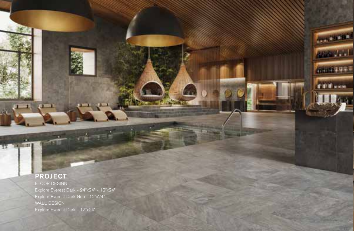
PROJECT FLOOR DESIGN Explore Everest Dark - 24"x24" - 12"x24" Explore Everest Dark Grip - 12"x24" WALL DESIGN Explore Everest Dark - 12"x24"