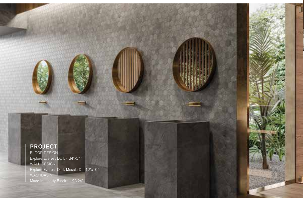
PROJECT FLOOR DESIGN Explore Everest Dark - 24"x24" WALL DESIGN Explore Everest Dark Mosaic D - 12"x10" WASHBASIN Made In Liberty Black - 12"x24"