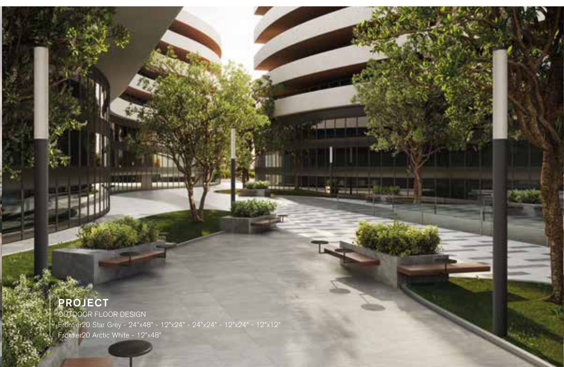
PROJECT FLOOR DESIGN Frontier20 Star Grey - 24"x48" - 12"x24" - 24"x24" - 12"x24" - 12"x12" Frontier20 Arctic White - 12"x48"