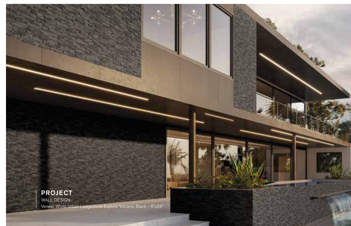
PROJECT WALL DESIGN Veneer World Urban LedgeStone Explore Volcanic Black - 6"x24"