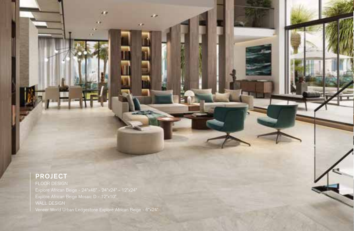
PROJECT FLOOR DESIGN Explore African Beige - 24"x48" - 24"x24" - 12"x24" Explore African Beige Mosaic D - 12"x10" WALL DESIGN Veneer World Urban LedgeStone Explore African Beige - 6"x24"