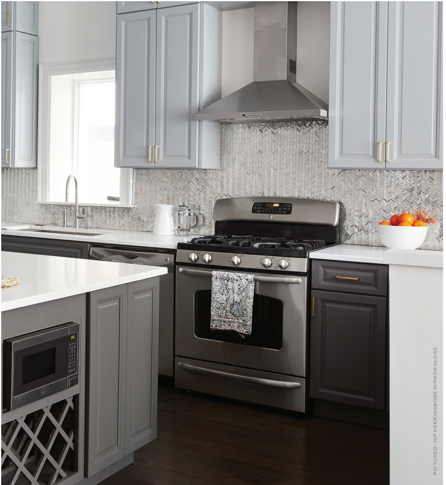
PICTURED: HIP HERRINGBONE MIRROR GLOSS

Activate your space with snazzy Hip Herringbone. A modern twist on a classic herringbone pattern, Hip Herringbone's bold colors and intricate handwork make it a true knockout. Stocked in two colorways and fully customizable by special order.