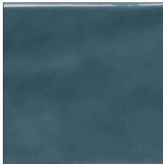
ATLANTIS BLUE | Glossy T-VS-SPLS-ATLB-WT-3X12-GLS