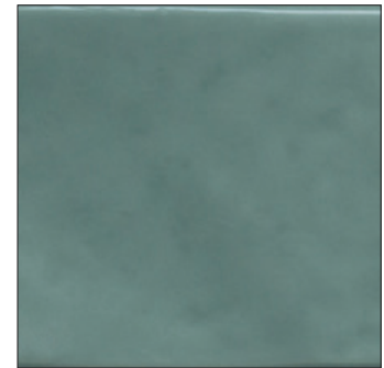
OCEANFRONT | Glossy T-VS-SPLS-OCNF-WT-3X12-GLS