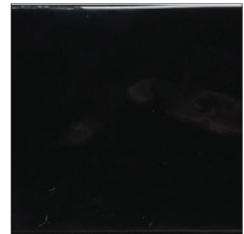
SQUID INK | Glossy T-VS-SPLS-SQDI-WT-3X12-GLS

Material Composition: White Body Application: Wall Wet or Dry Minimum Grout Joint: 1/8" Recycled Content: 21% Water Absorbtion: >10% Abrasion Resistance/PEI: 1 Scratch Hardness/MOHS: 3 Country of Origin: Spain