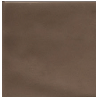
DRIFTWOOD | Glossy T-VS-SPLS-DFW-WT-3X12-GLS