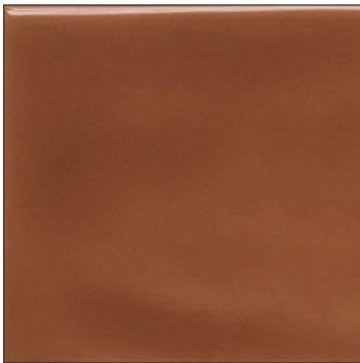
SEDONA SUNSET | Glossy T-VS-SPLS-SDSN-WT-3X12-GLS