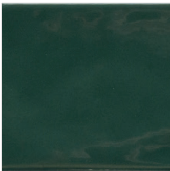
SEAWEED | Glossy T-VS-SPLS-SEWD-WT-3X12-GLS