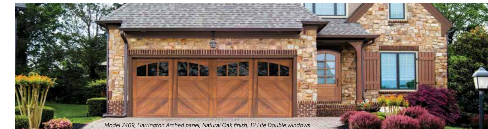
Model 7409, Harrington Arched panel, Natural Oak finish, 12 Lite Double windows

*Wayne Dalton uses a calculated door section R-value for our insulated doors. **Some heights and widths will be special order. Contact Customer Service for details. ***See wind load document on each product for details and ratings. *Section thickness may vary slightly depending on wood type.