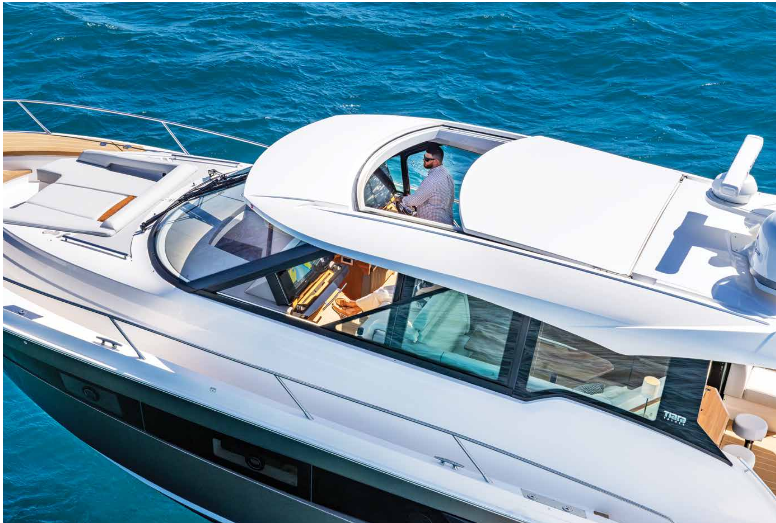
The Tiara EX 54's bridge deck can be closed up and climate-controlled or fully open for sun and breezes.

THE TIARA YACHTS EX 54 IS A MID-30-KNOT CRUISER WITH THREE STATEROOMS AND AN ARRAY OF COCKPIT LAYOUT OPTIONS. BY CHRIS CASWELL