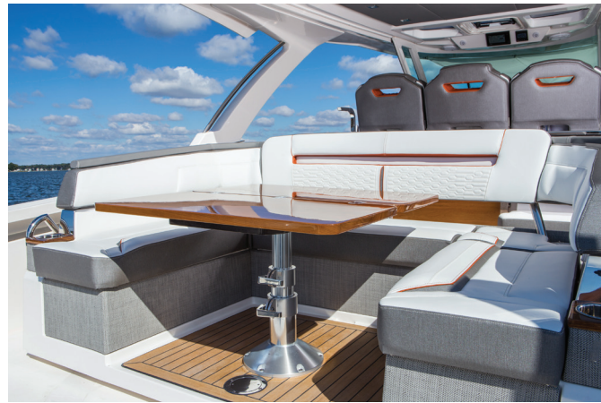
Dayboating is taken to a new level of style and luxury in the new Sport series, with triple seats at the helm and big lounges in the cockpit.

Show Innovation Award in the cuddy cabin and bowrider category, and sales coming off of the show have been relatively strong.