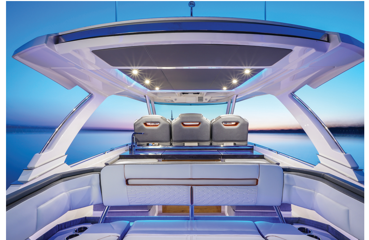
The engineering expertise of Tiara shows in the dramatic lines of the hardtop with three skylights, which the builder makes in-house.

This boat's true heart lies in its aft cockpit, however. In keeping with a current industry trend, that space is designed to provide a close