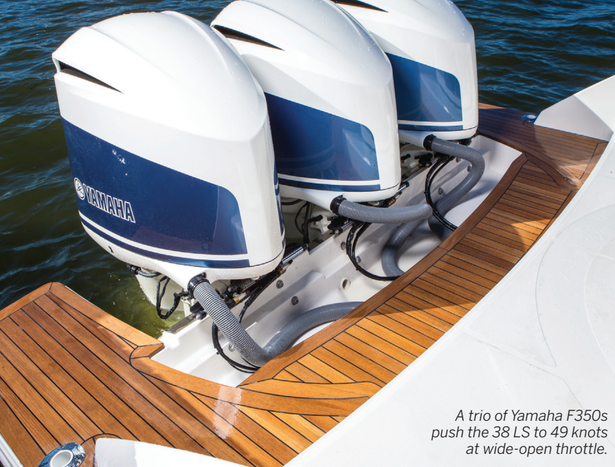
A trio of Yamaha F350s push the 38 LS to 49 knots at wide-open throttle.