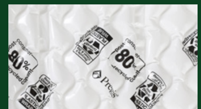
Renew PCR – Premium Sustainability