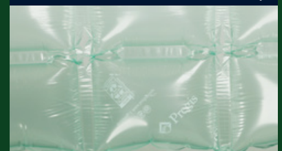
Renew – Sustainability