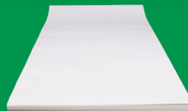
Newsprint rolls and sheets