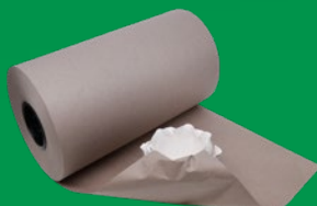
Gray bogus rolls and sheets