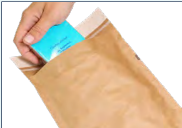
Curbside recycled mailers