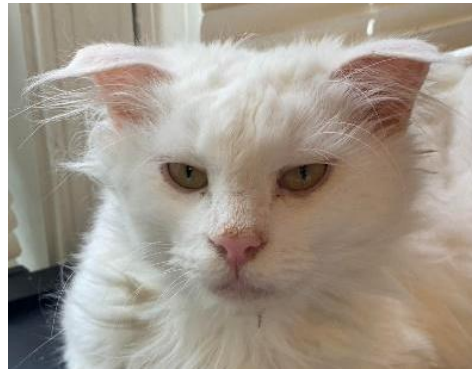
Figure 2. Folded ear tips were reported as an adverse effect of unlicensed molnupiravir therapy in Cat #21.

Cat #22 was reported to have severe leukopenia. Through veterinary records, cat #22 was found to have moderate panleukopenia with lymphopenia, neutropenia, and normal hemogram and thrombogram on 4 out of 5 sequential complete blood counts, which were confirmed through veterinary records of sequential complete blood counts. The first reported white blood cell count was 10,700 cells per microliter (reference range 3500–16,000 cells per microliter). The next four complete blood counts showed white blood cell counts ranging from 1200 to 1900 cells per microliter. The first neutrophil count was 8560 cells per microliter (reference range 2500–8500 cells per microliter). The next four neutrophil counts ranged from 696 to 1292 cells per microliter. The first lymphocyte count was 1177 cells per microliter (reference range 1200–8000 cells per microliter). The next four lymphocyte counts ranged from 330 to 532 cells per microliter.