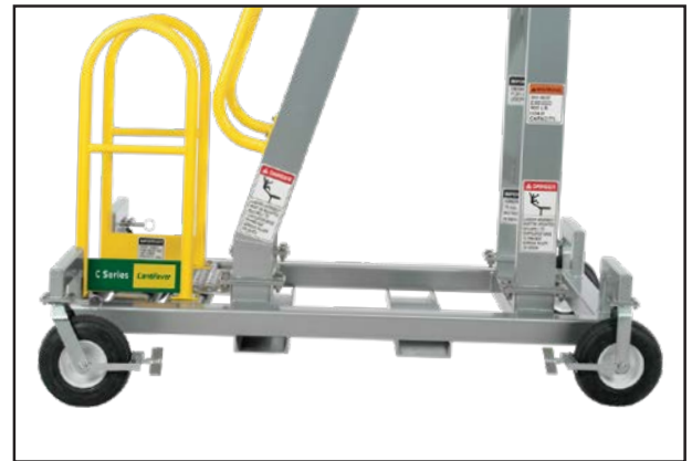
▲ Then galvanized steel base provides incredible stability, while large no-flat tires allow it to be easily maneuvered.