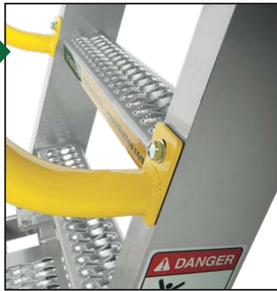
▲ All-weather slip-resistant tread.