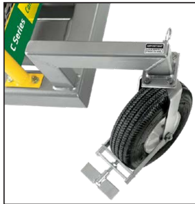
▲ Wheels swivel 360° for easy placement.