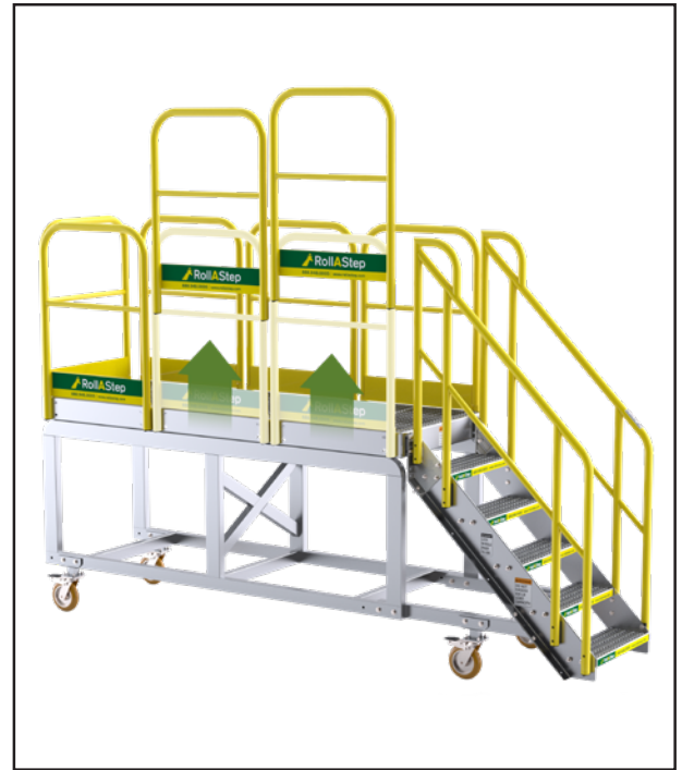
▲ Six square feet of work area is roomy enough for an operator and equipment.