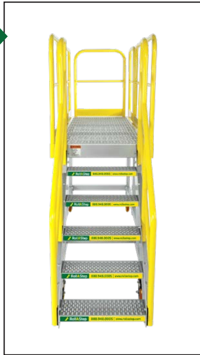
▲ Full-size, powder-coated handrails.