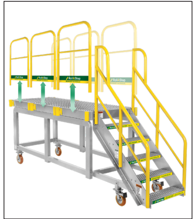
▲ Six square feet of work area is roomy enough for an operator and equipment.