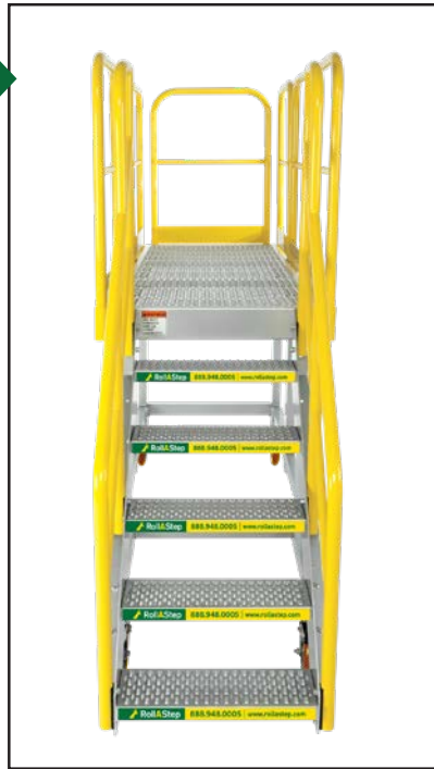
▲ Full-size, powder-coated handrails.