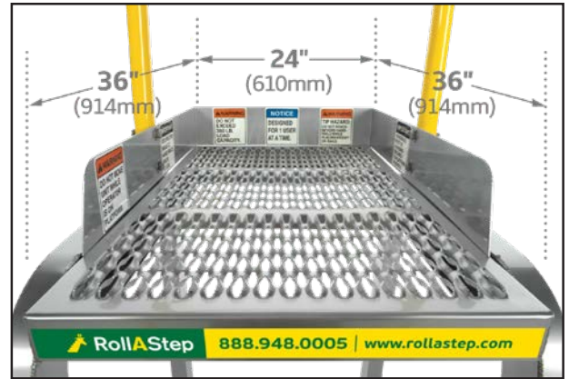
▲ Six square feet of work area is roomy enough for an operator, tools and parts.