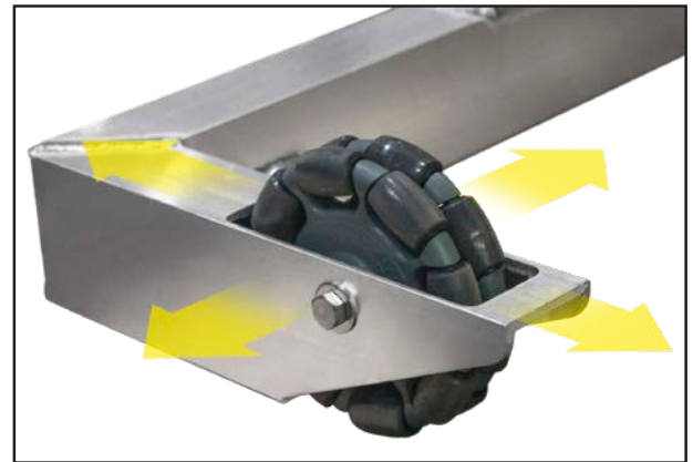
▲ The unique side-rolling casters make the TR Series easy to position in tight areas.