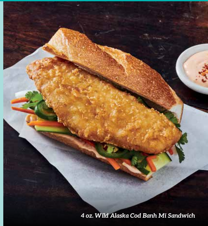
4 oz. Wild Alaska Cod Banh Mi Sandwich

Made with real beer batter, your patrons will enjoy our premium PubHouse® Golden Ale Beer-Battered Seafood. Available in various sizes of Wild Alaska Pollock, Wild Alaska Cod, Haddock, and tail-off Shrimp, you'll appreciate the care we take in creating these seafood offerings – especially the handmade appearance, the light crunch, the real beer flavor, and the precise portions. Try serving with french fries, in a soft taco, on a warm bun, or with a tart, creamy dipping sauce.