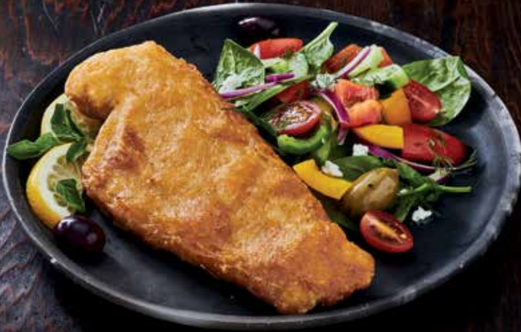
4 oz. Haddock Sub Sandwich