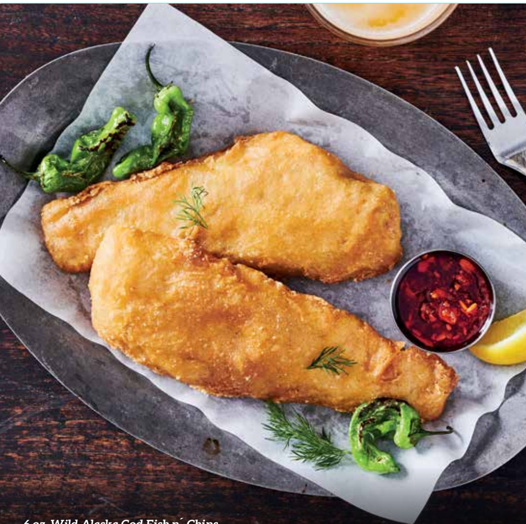
6 oz. Wild Alaska Cod Fish n' Chips