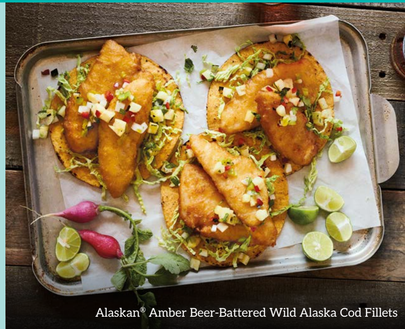
Alaskan® Amber Beer-Battered Wild Alaska Cod Fillets

Trident Seafoods and Alaskan® Brewing Co. have teamed up to bring you the sweet, flaky tenderness of Wild Alaska Cod fillets with the robust, authentic flavor of Alaskan® Amber beer. With a super crunchy bite, each fillet is skinless, boneless, and hand cut, offering you precise portion control with no waste or prep.