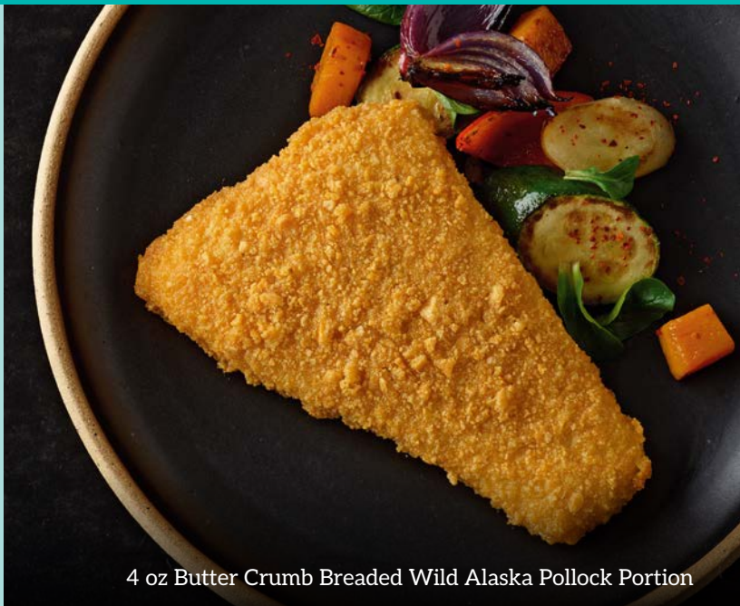
4 oz Butter Crumb Breaded Wild Alaska Pollock Portion

Butter Crumb Wild Alaska Pollock portions are oven-ready fillets of golden-brown, buttery-crunch delights. With low sodium and high protein, they're also a delicious option for schools and hospitals looking for a healthy comfort food option. The cracker crumb breading gives this refreshingly light and tender fish a delicious crunch.