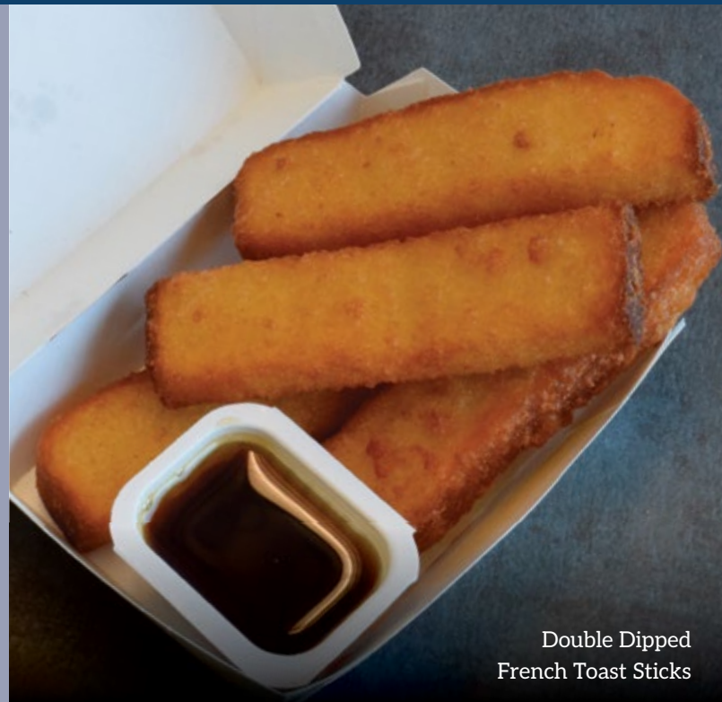
Double Dipped French Toast Sticks

Double Dipped French Toast Sticks are what everyone is looking for: a convenient breakfast option that's quick to prepare and easy to eat on-the-go. Like the name says, we batter-dip our French toast sticks two times. The first dip seals in sweet cinnamon and vanilla flavor. The second dip builds an exterior that crisps up when cooked, keeping the inside deliciously fluffy. Bonus: Our Double Dipped French Toast Sticks are made without high fructose corn syrup, artificial flavors, or preservatives. Just double-dipped French toasty goodness.