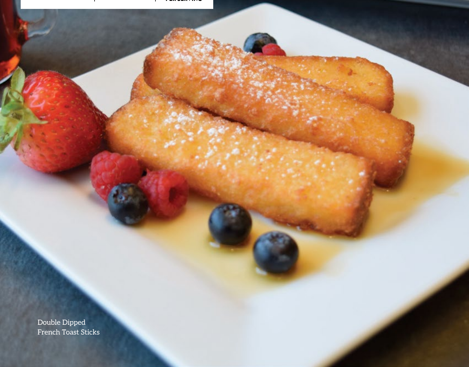
Double Dipped French Toast Sticks