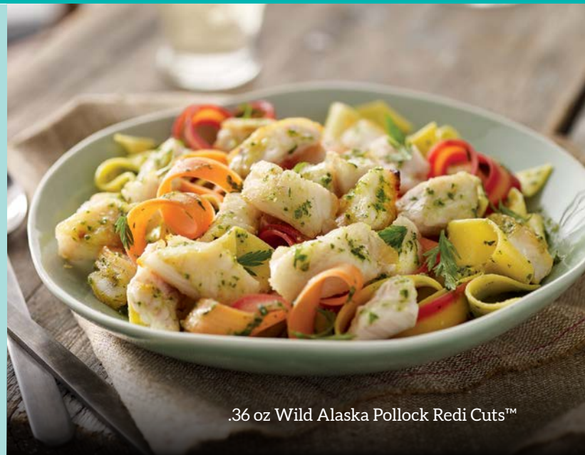
.36 oz Wild Alaska Pollock Redi Cuts™

Wild Alaska Pollock Redi Cuts™ are a sustainable and easy-prep seafood choice. These 0.36 oz pre-cut diamond-shaped pieces make it easy to add high-quality Alaska seafood into a variety of dishes, like salads, sandwiches, soups, and tacos. Wild Alaska Pollock Redi-Cuts™ help reduce labor costs and prep time while delivering a tasty and healthy menu option for your customers.