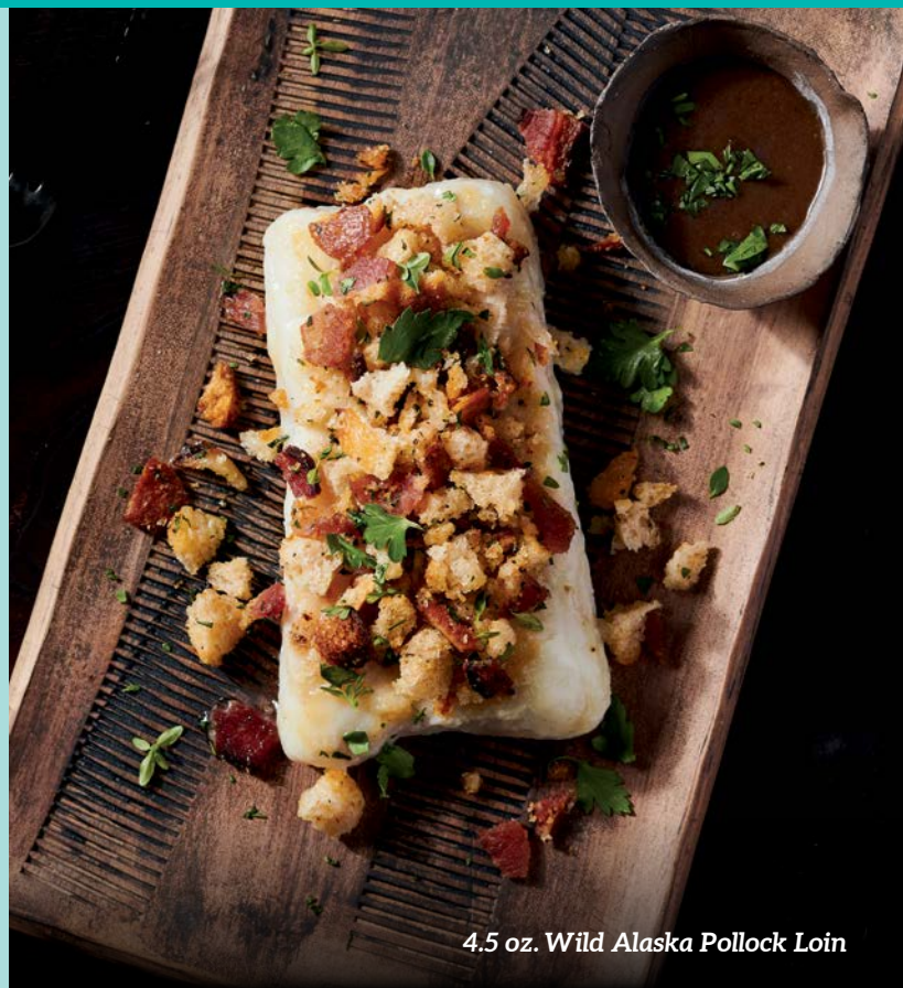
4.5 oz. Wild Alaska Pollock Loin

Trident Seafoods' innovative Entrée Redi line is a versatile option for your menu. These sustainable seafood fillets come in various sizes and feature a unique seaweed-based coating that sears beautifully, preserves moisture, and holds the fish together. These Wild Alaska Pollock fillets are an outstanding center-of-the-plate option with a mild flavor, pure white meat, and flaky texture. Whether you cook them on a skillet or open grill, our Entrée Redi line delivers a popular, sustainable choice for your customers.