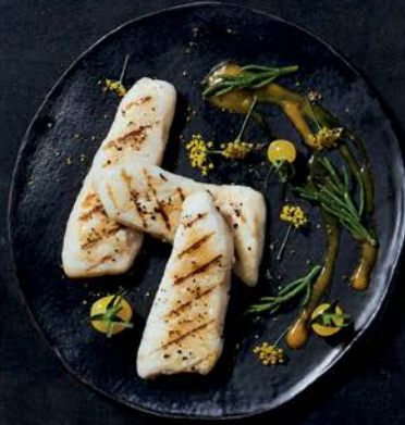
1.5 oz. Mini Tender Portions