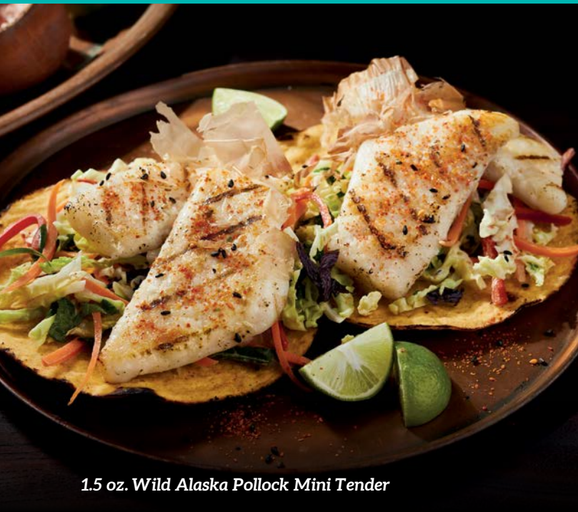
1.5 oz. Wild Alaska Pollock Mini Tender