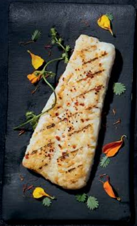
5.7 oz. Fillet Portions