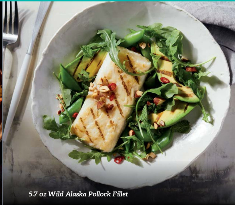
5.7 oz Wild Alaska Pollock Fillet