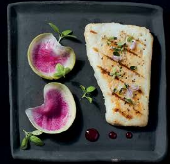
4.2 oz. Fillet Portions