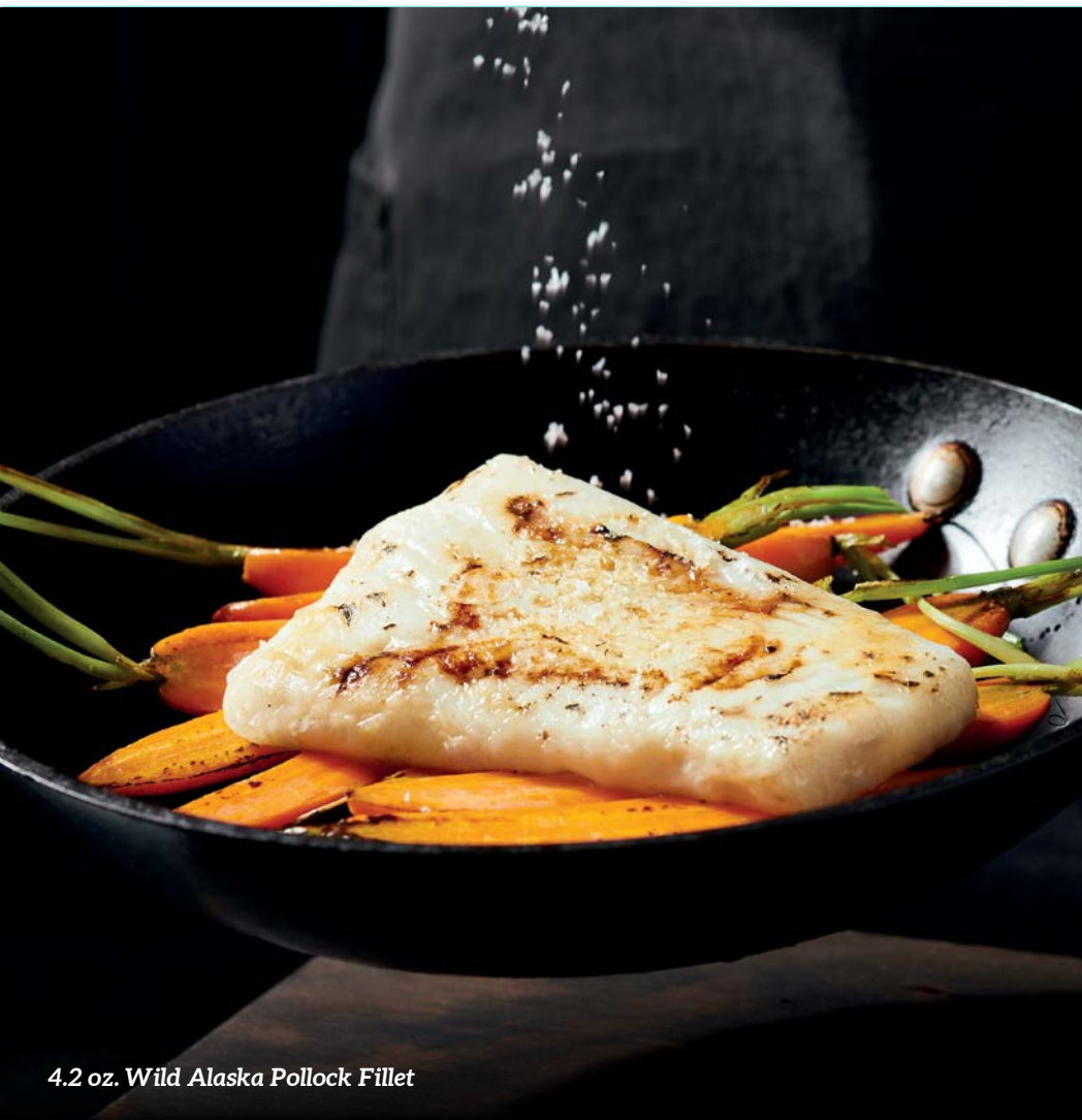
4.2 oz. Wild Alaska Pollock Fillet