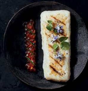
4.5 oz. Loin Portions