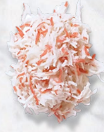
SHRED STYLE (REGULAR + SUPER)

Our most popular shape, a mix of shreddable flakes for flavor and volume, and firm chunks for authentic bite. Great for salads, pastas, wraps, seafood rolls, ceviche, and dips.