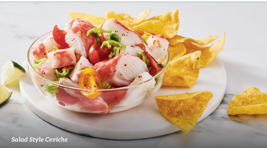
Salad Style Ceviche