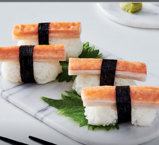
Captain Jac® Real Simple Sushi Leg