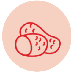
STARCH: POTATO, WHEAT, CORN, TAPIOCA