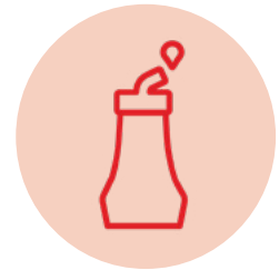
FLAVORING: BOTH NATURAL AND ARTIFICIAL, MIRIN