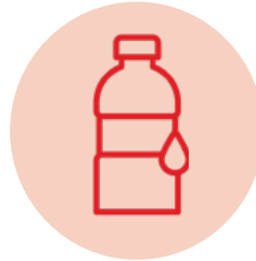
OIL: SOYBEAN AND CANOLA