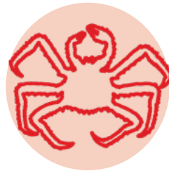
CRAB MEAT: SNOW CRAB OR KING CRAB