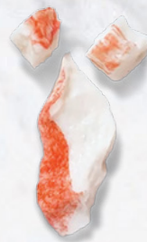
SALAD STYLE (FLAKE + CHUNK)

A durable, bite-size shape, Chunks are ideal for recipes wanting a firm morsel of flavor – like soups and bisques, or appetizers and skewers.