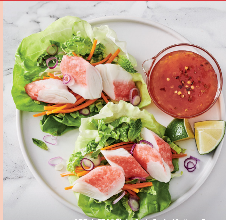
LEG-A-SEA® Flake Style Surimi Lettuce Cups

Our Surimi Seafood is a versatile and delicious option for the food service operators. Made from Wild Alaska Pollock or Pacific Whiting, it's fully cooked and ready to use, saving time and money. With a mild flavor, and a variety of shapes and textures, surimi seafood is adaptable to a wide range of menu ideas, from classic crab cakes to modern sushi rolls.