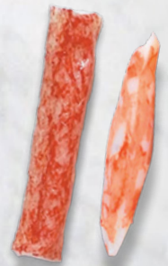
WHOLE LEG STYLE

The preferred form for California rolls, this style also performs beautifully as an extender when blended with shellfish. Great for sushi, pizza, stuffings, crab cakes, appetizers, shreds and dips.