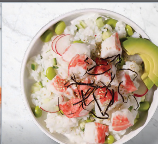
Salad Style Surimi Seafood