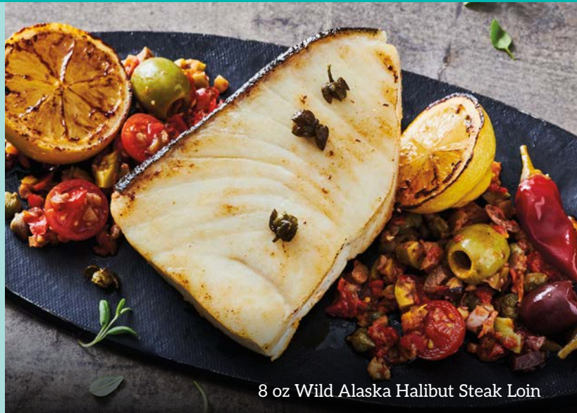
8 oz Wild Alaska Halibut Steak Loin

Wild Alaska Halibut, longline-caught in the icy waters of Alaska, is portioned controlled and vacuum-packed at peak freshness. Its delicate flavor and firm texture make it an enduring favorite of seafood enthusiasts. From pan-seared fillets, to grilled steak loins, Trident Seafood Wild Alaska Halibut is a center-of-the-plate star.