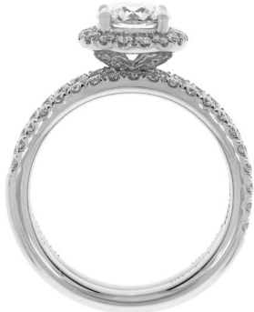
Photographs of jewelry style. Images not actual size. *Gram weights may change after final polishing or resizing.