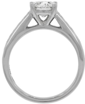
Photographs of jewelry style. Images not actual size. *Gram weights may change after final polishing or resizing.