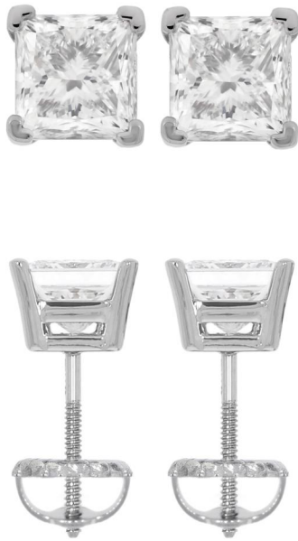
Photographs of jewelry style. Images not actual size. *Gram weights may change after final polishing.

One (1) Pair of 950 Platinum Ear Studs containing two (2) Square Modified Brilliant Cut Diamonds weighing a total of 2.02 carats. The studs have threaded posts with screw backs and weigh a total of 3.53 grams.