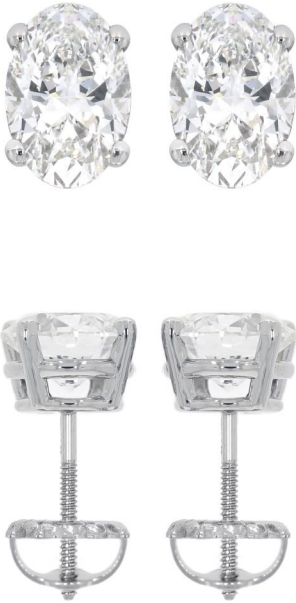
Photographs of jewelry style. Images not actual size. *Gram weights may change after final polishing.

One (1) Pair of 950 Platinum Ear Studs containing two (2) Oval Brilliant Cut Diamonds weighing a total of 2.11 carats. The studs have threaded posts with screw backs and weigh a total of 3.20 grams.