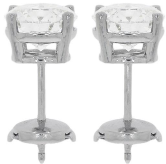
Photographs of jewelry style. Images not actual size. *Gram weights may change after final polishing.