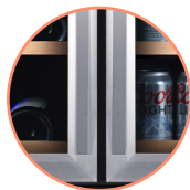
DESIGN CURVE HANDLE