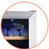
STAINLESS STEEL DOOR FRAME

* Capacities are approximate and calculated with bordeaux bottles type.