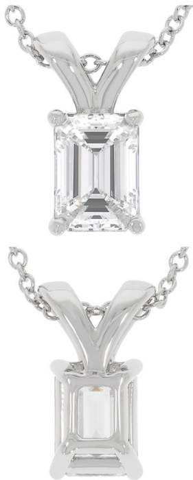
Photographs of jewelry style. Images not actual size. *Gram weights may change after final polishing or resizing.

One (1) 18 Karat White Gold Solitaire Pendant with Chain containing one (1) Emerald Cut Diamond weighing 1.00 carats. The chain is a 18 Karat White Gold 18" Cable chain. The pendant and chain weigh a total of 3.12 grams.